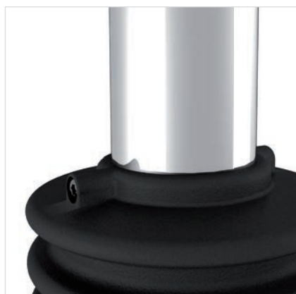
STAINLESS STEEL FINISHING