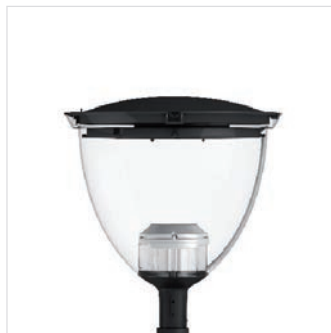
VENUS BIL ( Page 324 ).