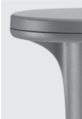
AC065 ANCHORAGE UNIT FOR ALDER SERIES